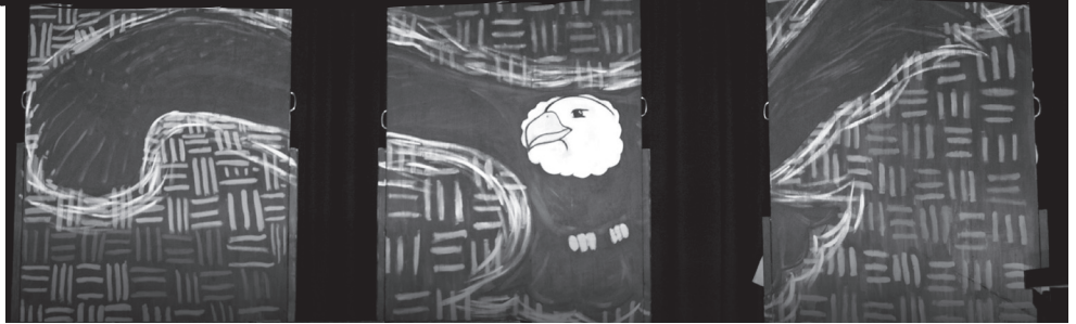
The GRYD production Life is a Journey inspired collaboration with youth in Youth Speak! Collective's GRYD mural painting class to create the eagle backdrop.

Swooping strokes of paint. News headlines transformed into collage. Anime-inspired renderings. The Unusual Suspects Theatre Company not only sets the stage for great storytelling but also gives participants the opportunity to explore other creative disciplines such as visual art. Oftentimes, the characters and stories created in the theatre process inspire paintings, sketches, and collages.