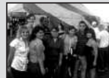
US alumni and staff eagerly anticipate the start of Cirque du Soleil's Corteo .

From all of US to you, THANK YOU for your generosity and support!