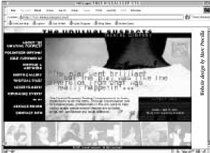
The Unusual Suspects' colorful home page features photos of the kids in action onstage and some of their original writing.